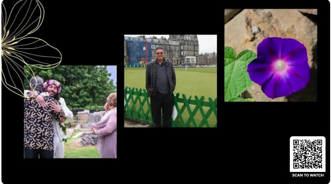
Memoreis of Dad